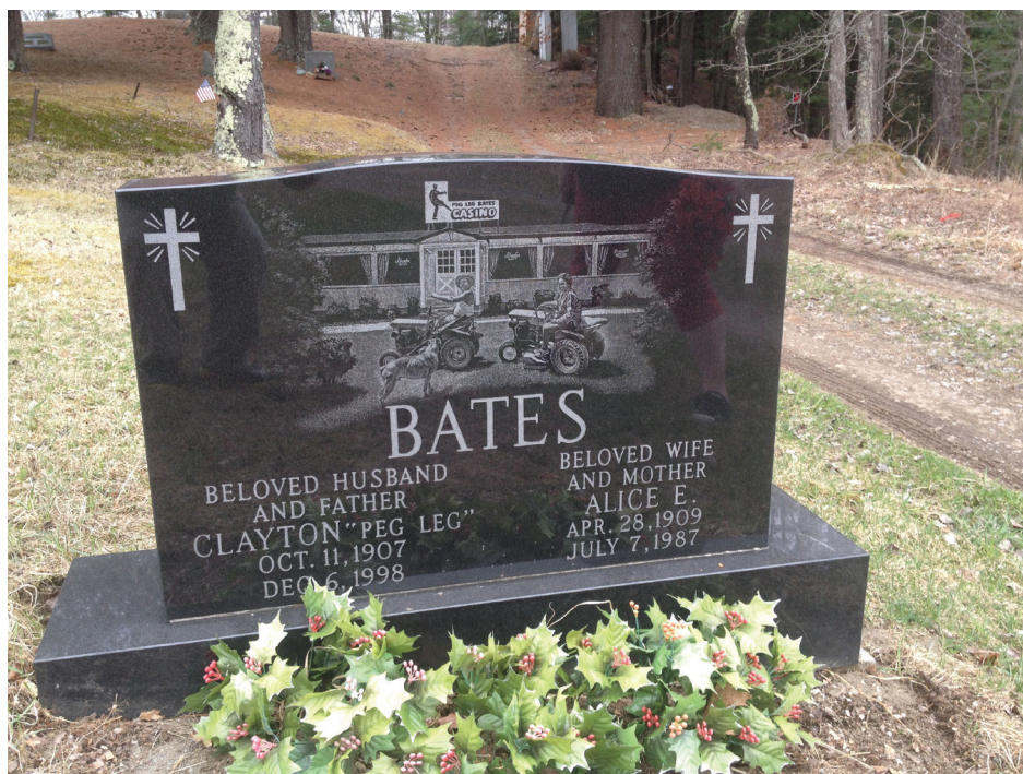
Gravesite of Peg Leg Bates.

He had an astute and intimate understanding of the financial situations forced upon Black performers and audiences. He