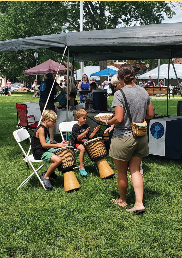
Learning to drum with Amorak Youth.