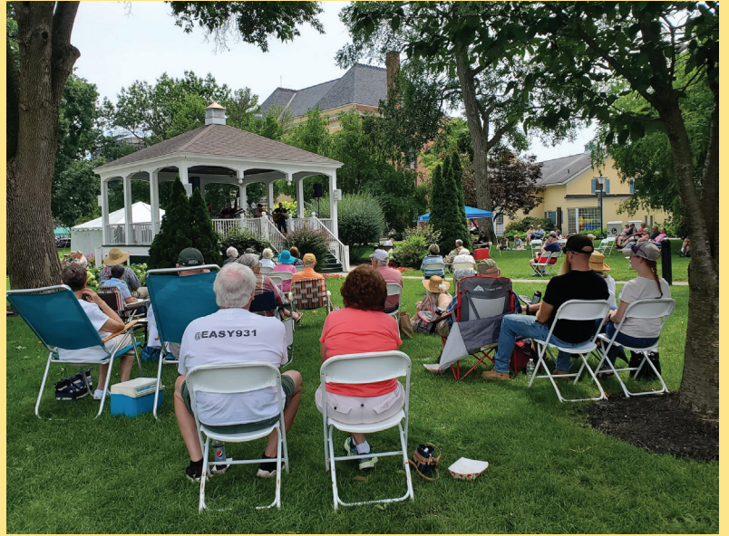
Folks enjoyed an entire day of music from the Bandstand in City Park.